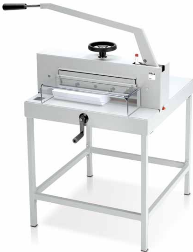
IDEAL 4705 with optional stand