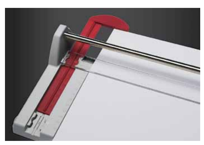
FRONT OR BACKGAUGE This extendable bracket with mm-scale can be used as either a front or a backgauge.