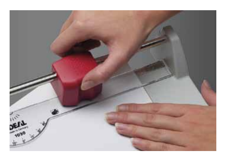
SAFETY CUTTING HEAD For safe and precise cutting: Ergonomically designed safety cutting head with rotary knife made of hardened steel.