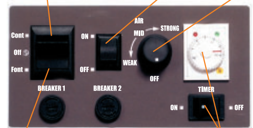
Foot operation (Operation panel) Timer