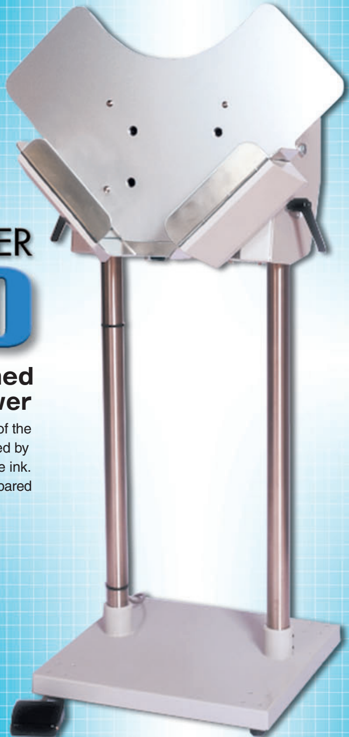
When A3 / Ledger size tray is used.