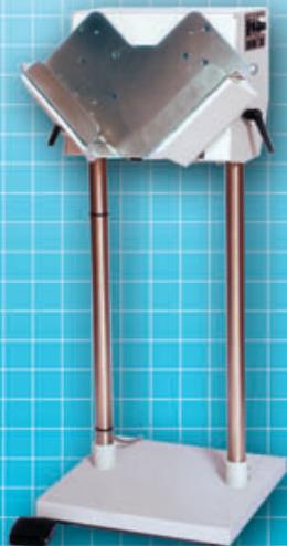
When A4 / Letter size tray is used.

Jogging time is significantly reduced by the effect of the air blower. Wet ink on printed papers is quickly dried by the air, thus preventing staining of the paper by the ink. See the effect and improvement in productivity compared with conventional joggers.