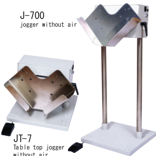
JT-7 Table top jogger without air