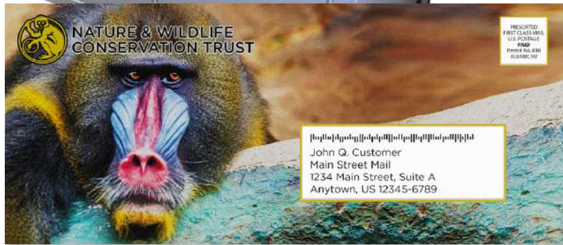
Actual scan of a full-bleed example printed on the MACH 6