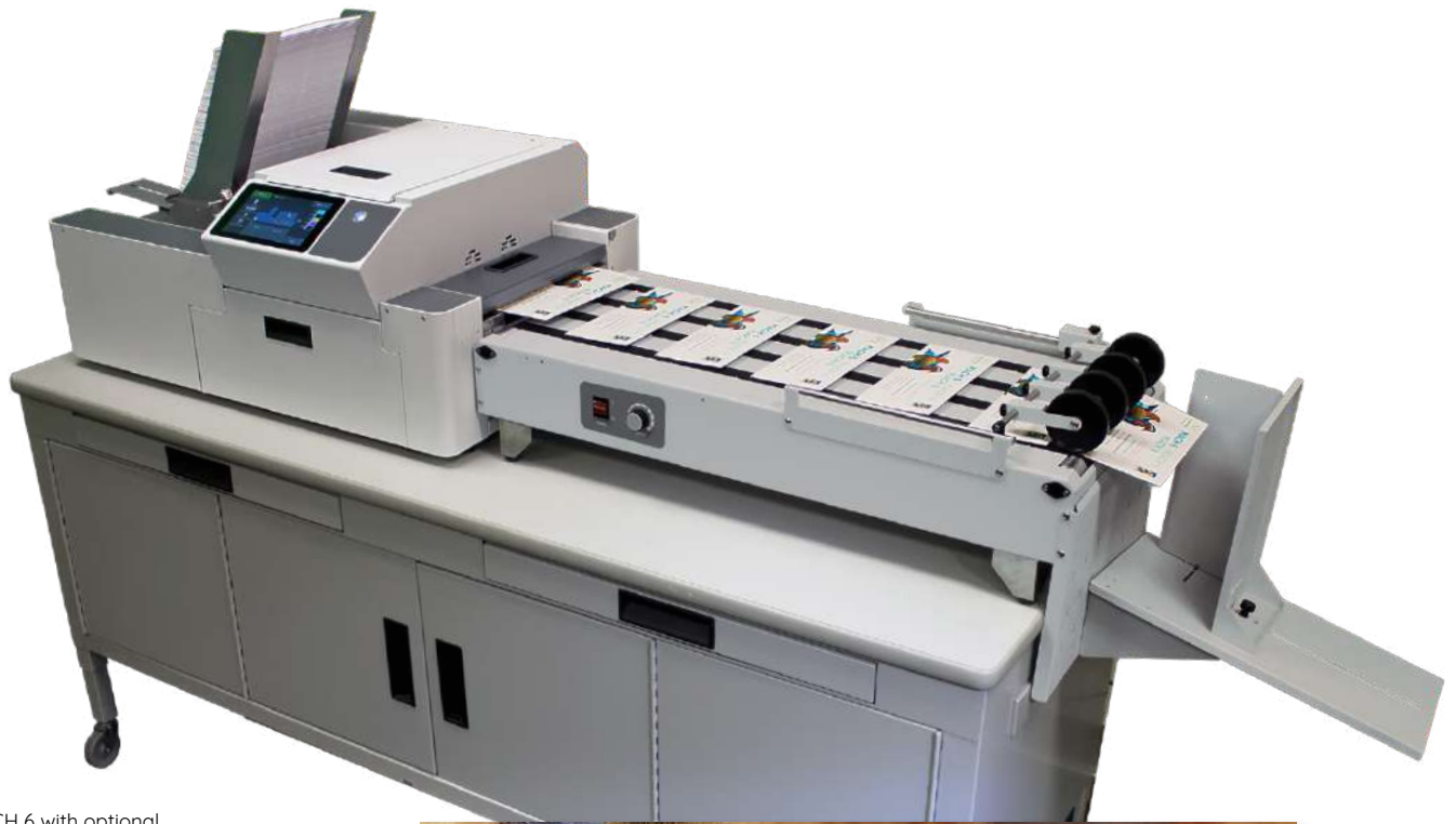
MACH 6 with optional conveyor stacker & cabinet base