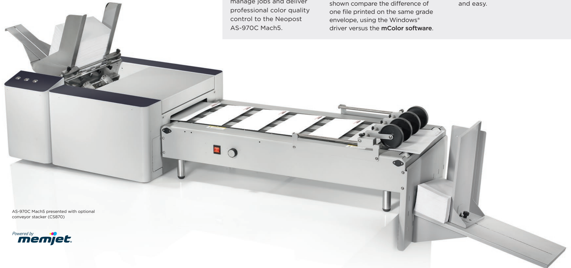
AS-970C Mach5 presented with optional conveyor stacker (CS870)

Capable of 152 mm per second at 1600 x 1600 dots per inch print (dpi) resolution, and 304 mm per second at 1600 x 800 dpi resolution, it offers production speeds of up to 7,500 DL envelopes per hour - compared to toner-based printers (e.g., LED and laser printers) that are limited to 3,000 pieces per hour at 1200 dpi.