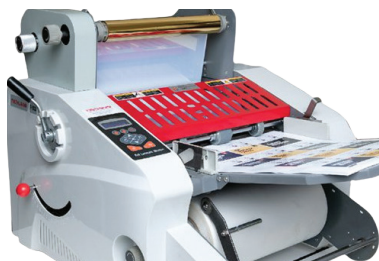
Double side lamination Double side lamination is available and easy to set up.