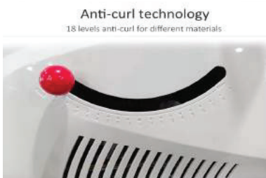
Anti-curling adjustment Adjustable curing tension with 18 levels anti-curling setting, which helps a lot to de-curl sheets after lamination.