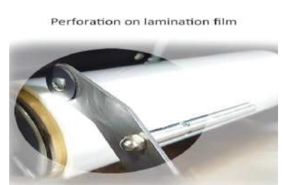
Auto perforating on film Auto perforating on side of lamination film, which makes the sheets easy to burst.