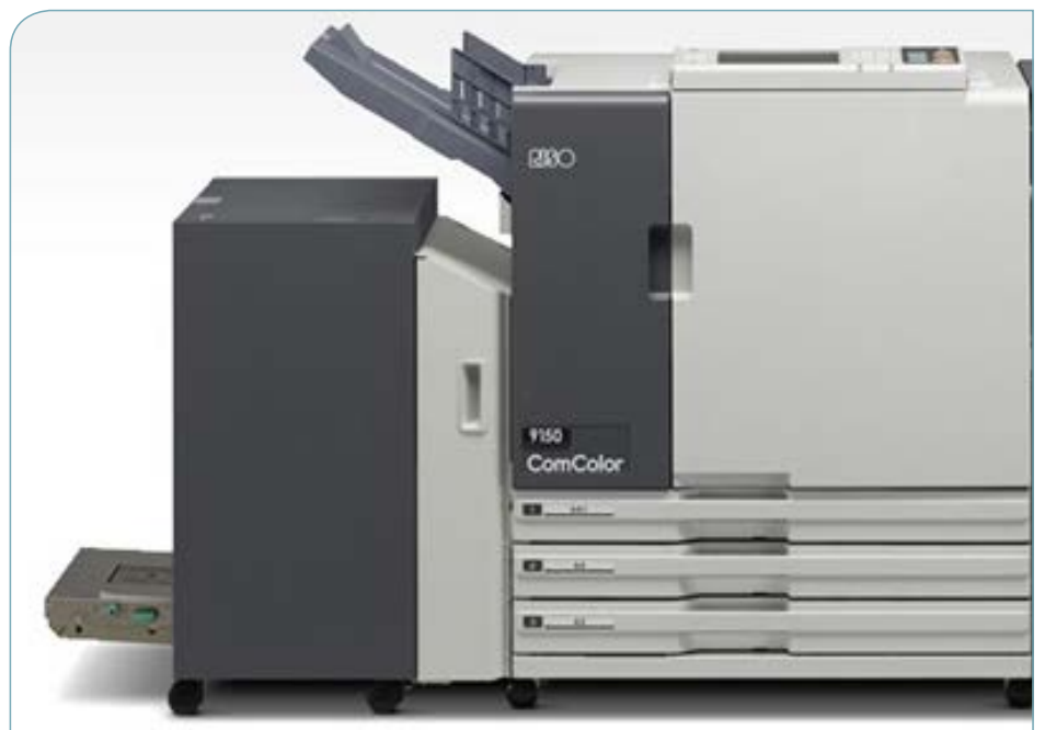
RISO ComColor 9150 High Capacity Tray (HCT) enables feeding capacity up to 5,500 sheets