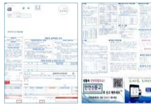
Both sides pre-printed form

Running both pre-printed form and blank form are supported with color inkjet printer. Blank form brings immediate realization of unlimited applications.