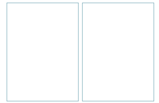
Both sides blank form