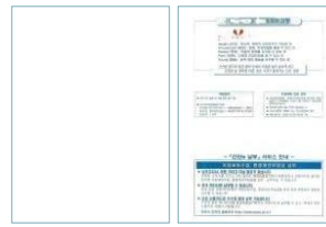
One side pre-printed form