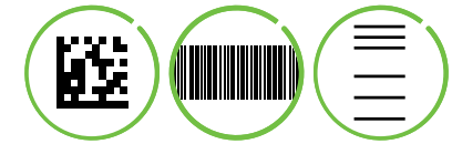
4. Auto Diversion

The feeders can be linked for cascade feeding. If one feeder runs empty, another one takes over, given a total capacity of 2000 sheets. The standard feeders contain empty sensors for auto-start after refilling the feeders.